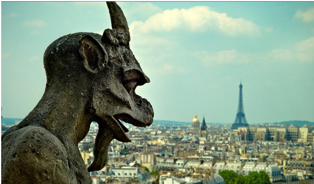
View of Paris from Notre Dame Cathedral